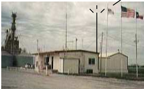
Feedyard Office with main Turnkey Server