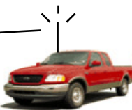
Feed Bunk Manager

Radio Frequency Modem Connection To the office server