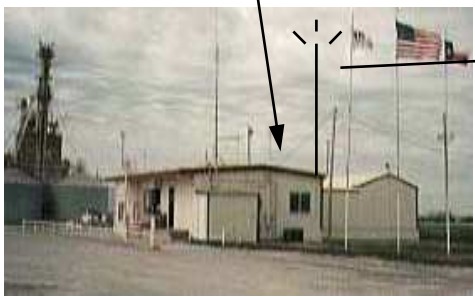
Feedyard Office with main Turnkey Server

Radio Frequency Modem Connection To the office server